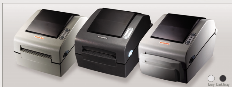
SLP-D420 (Standard Type)