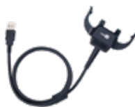
USB snap-on Cable