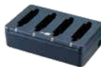
4-slot Battery Charger