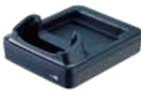
Charging and Communication Cradle