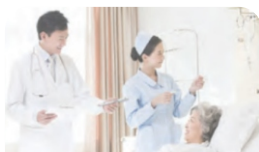
Medical and healthcare