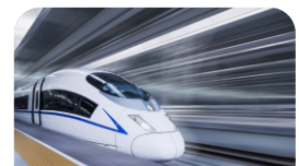
Railway and transportation